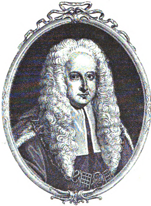
LORD CHIEF JUSTICE WILLES.