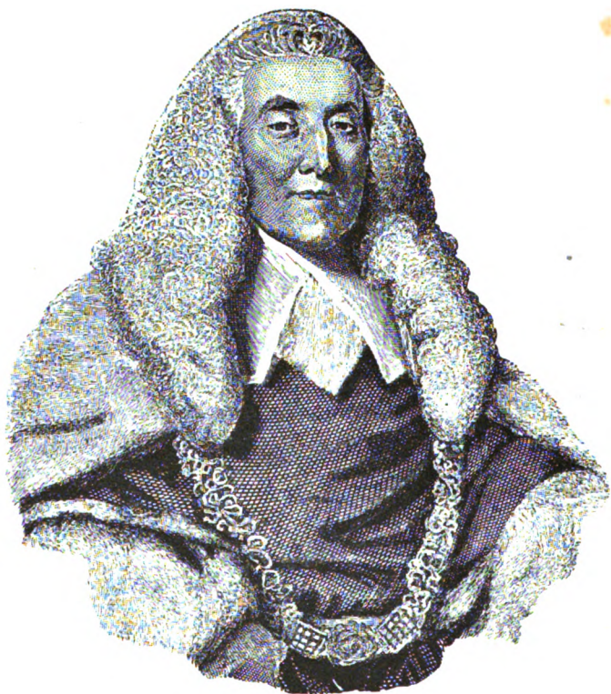
LORD CHIEF JUSTICE MANSFIELD.