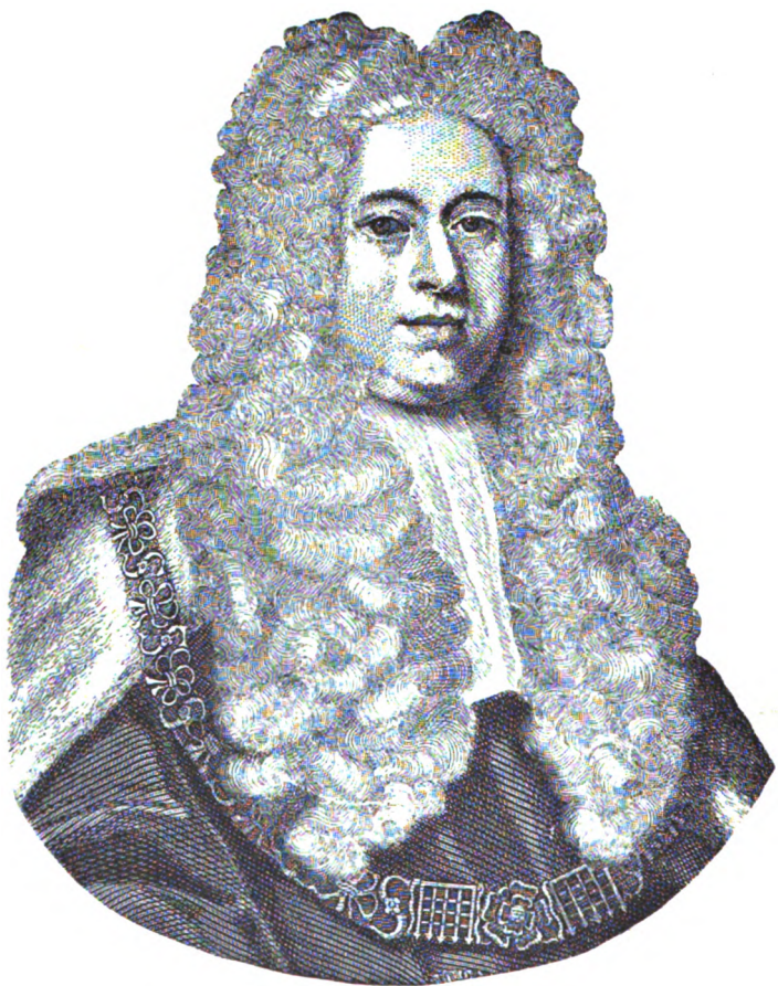
LORD CHIEF JUSTICE RAYMOND.