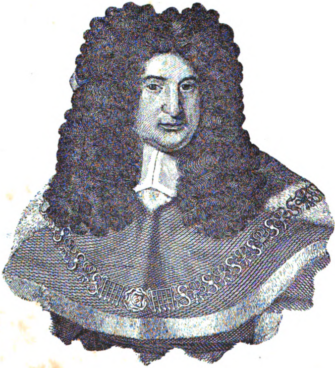
LORD CHIEF JUSTICE HOLT.